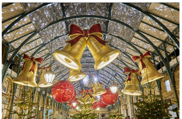
Christmas decorations in the famous Covent Garden Market Building